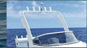
A Folding Rocket Launcher is a standard feature on all Centre Cabins.