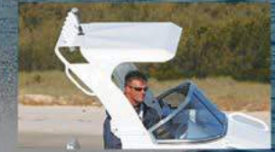
HARD TOP VISOR - FOLDING OFFSHORE 550, 580, 620, 660, 700, 740 Classic 550, 580