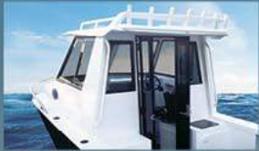
FULLY ENCLOSED CABIN HARD TOP OFFSHORE 740