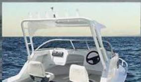
FOLDING ROCKET LAUNCHER WITH VISOR OFFSHORE 520, 550, 580, 620, 660, 700 Classic 520, 550, 580