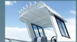
ENCLOSED CABIN HARD TOP OFFSHORE 580, 620, 660, 700, 740 Classic 580