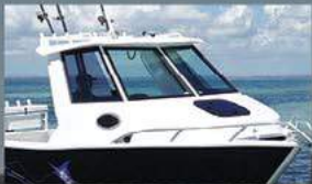
ENCLOSED CABIN HARD TOP OFFSHORE 580, 620, 660, 700, 740 Classic 580