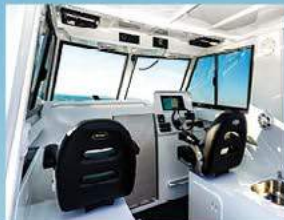
NEW OPTION: LOCKABLE ROLLER DOOR HARD TOP OPTION AVAILABLE ON OFFSHORE SIZES 580 TO 740 AND CLASSIC SIZE 580.