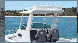
OPEN CABIN HARD TOP - FIXED OFFSHORE 580, 620, 660, 700, 740 Classic 580