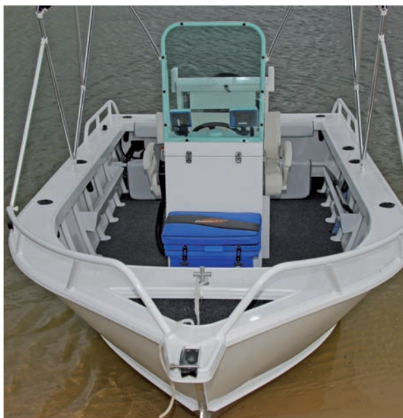
A clean uncluttered layout makes the Formosa 520 an excellent fishing boat for the serious angler.

starting around the $27,750 mark. Coastal Powerboats can be contacted on: ph. (07) 5526 0858, or online at info@coastalpowerboats.com.au .