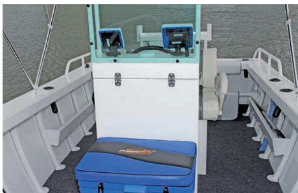
The padded icebox is an ideal seat for a front passenger and can take care of the catch as well.

ever have too much storage area in a centre console rig? I doubt it.