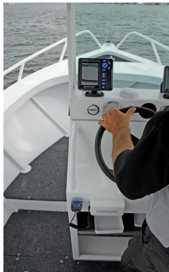
The Formosa features a straightforward dash layout with instruments that can be easily monitored.

Length: 5.2m Beam: 2.3m Weight of hull: 500kg Deadrise: 12 degrees Engine ratings: 75 to 90hp Engine: 90hp Suzuki four-stroke Fuel capacity: 115L Towing: family six sedan or wagon