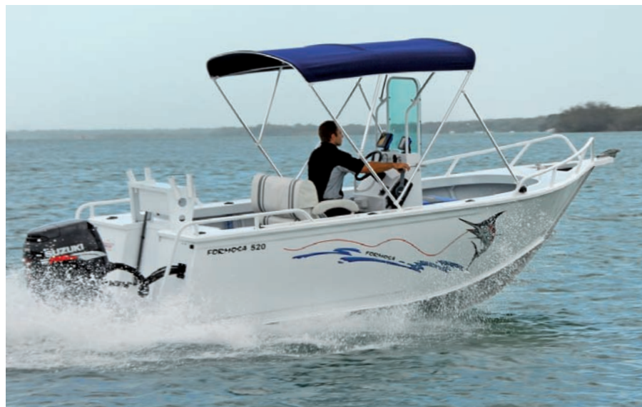
This shot of the Formosa underway gives an idea of the craft's ample freeboard.

The Formosa 520 offers ample work area in a set-up that makes fishing a pleasure. Five anglers, from nearly anyplace on the boat can fit without much bother. Up front there is an open anchor well equipped with bow roller and a T-bollard with a split bow rail low enough to be unobtrusive. A pair of anglers could easily work up here, and an icebox with padded lid doubles as a seat. There is also an underfloor storage hatch below the icebox, which was quite handy. Could you