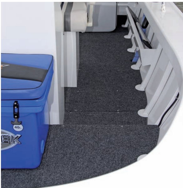
Note the Formosa's strong floor to gunwale ribs. A rigid hull is a feature of the craft.

craft. The test rig was equipped with Formosa's deluxe package, which includes the striking marlin