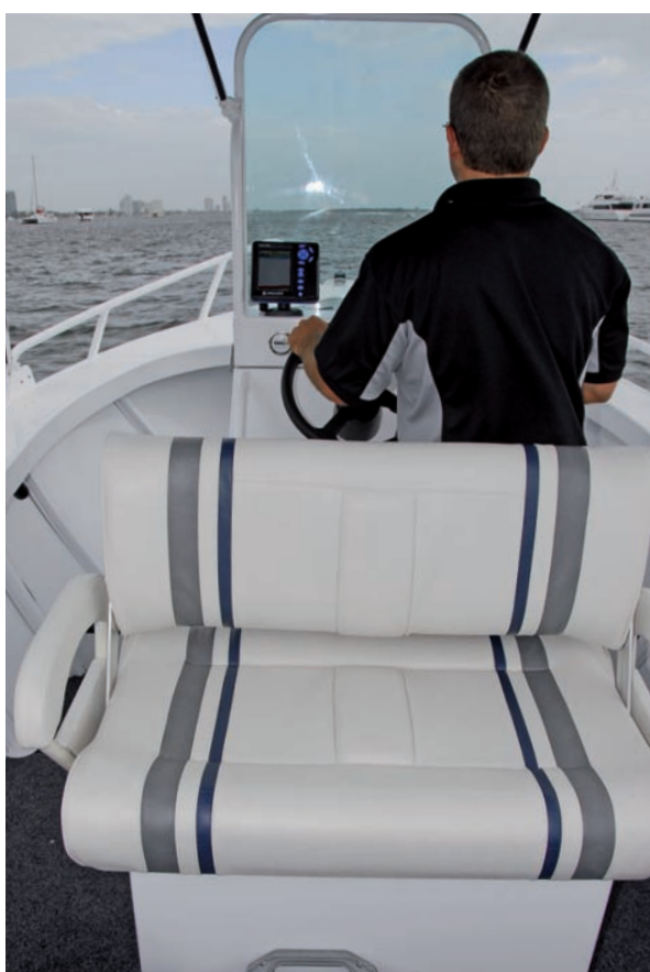
The Formosa's deluxe fore/aft bolster seat is an effective way of providing flexible seating arrangements.