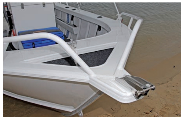
The Formosa's deep anchor well is serviced by a large bowsprit and bow roller.

On top of the console, at the base of the windscreen, a Navman Fish 4507 sounder and Navman Tracker 5430 are easily monitored while gauges and instruments to monitor the four-stroke Suzuki, including an hour