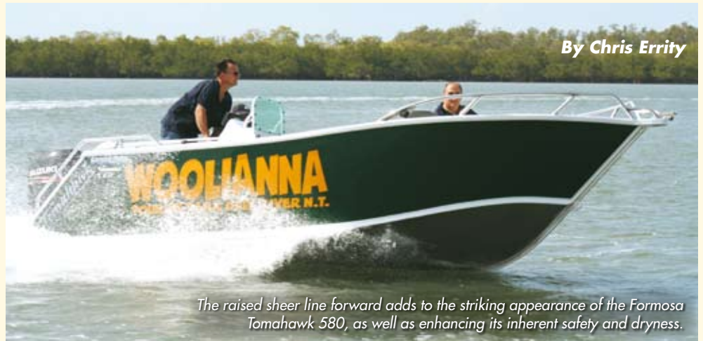
By Chris Errity

The Tomahawk series also come standard with high tensile 5083 aluminium 4mm side and bottom sheets. These boats are built extremely tough and will not let you down in rough conditions. We tested the Formosa 580 Tomahawk from Quality Marine in Darwin Harbour with a stiff 15 knot sea breeze blowing in from the north. Even though the conditions were still relatively calm in the sheltered waters, there was still a half metre chop, which the hull handled